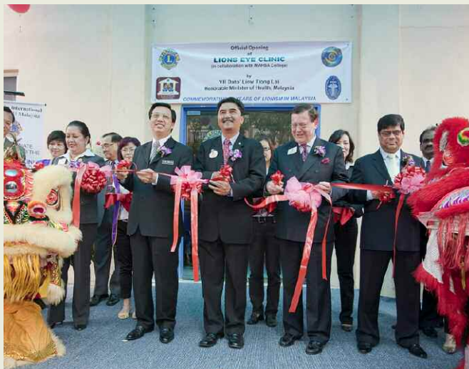
The Official Opening of the Lions Eye Clinic

The Eye Clinic, which has begun services, has screened more than 60 patients thus far. Patients have already been identified for surgery. We are waiting for the final bacterial counts for the operation theater, to ensure its sterility, for surgery to begin. Fellow Lions, the second part of the project is now ready for take-off. This involves our goal for "Lions Vision 20/20 for our Elders". This is a move to identify those in old folk's homes who are blind due to cataract and provide them with free surgery such that their twilight years may be easier for them and hopefully more productive and enjoyable. C'mon Lions, let us now use our Eye Clinic to bring maximum relief for the needy.