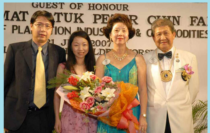
his immediate family,