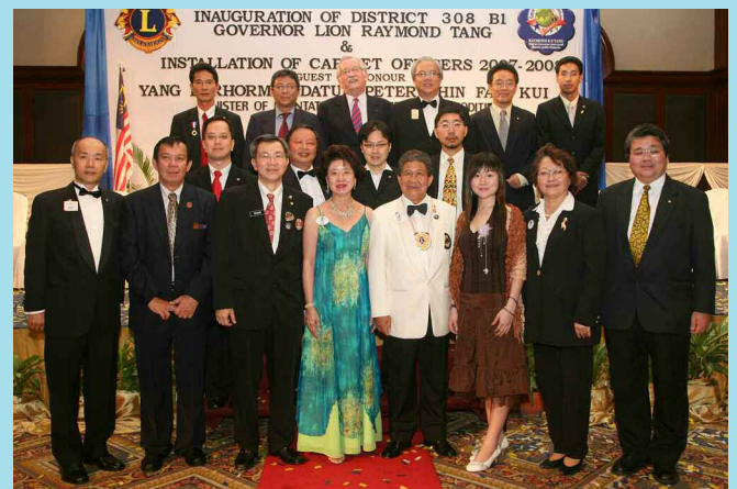
and his home club members (KL North) at the DG Inauguration Dinner.